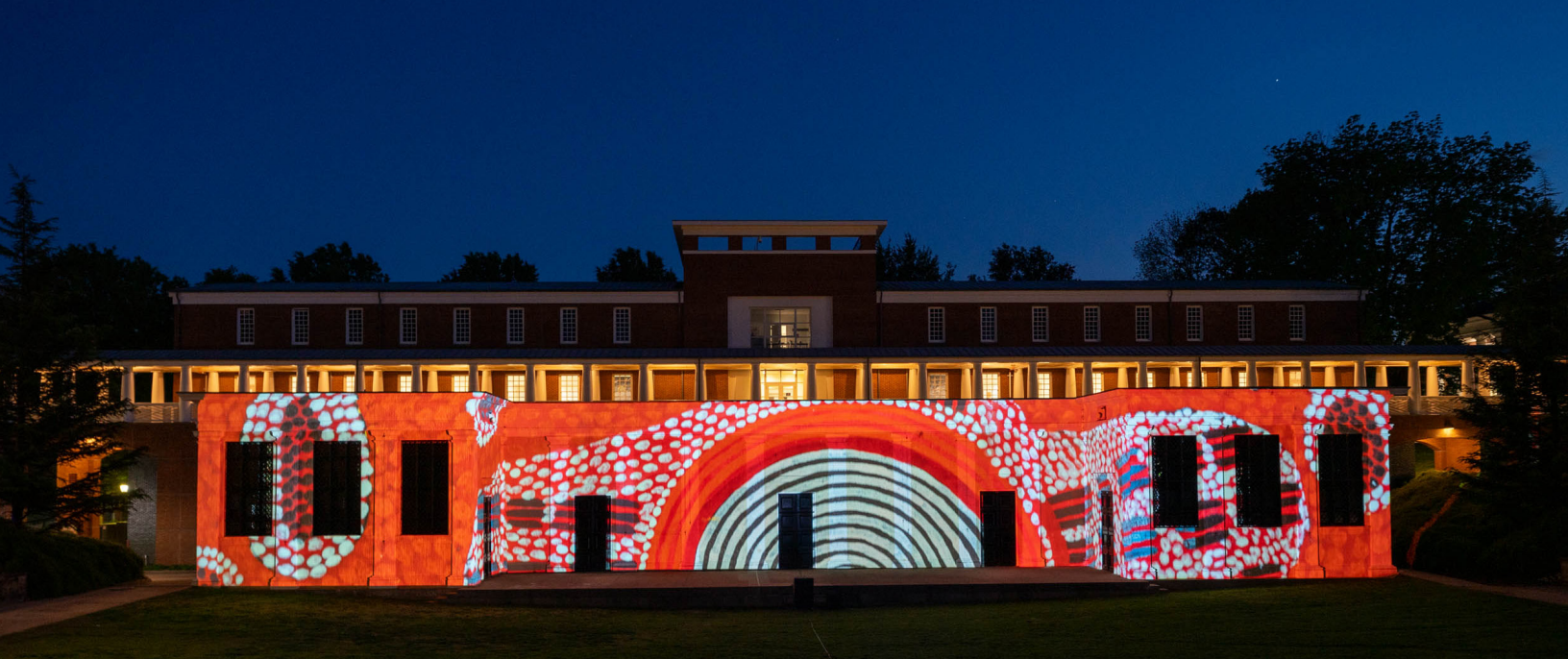
Artworks from the exhibition Irritjja Kuwarri Tjungu | Past & Present Together are projected onto the UVA Amphitheatre in the spring of 2021.